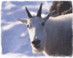
Mountain Publius Goat

"The American people will never knowingly adopt Socialism. But under the name of liberalism they will adopt every fragment of the Socialist program, until one day America will be a Socialist nation without knowing how it happened." Norman Thomas